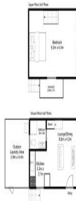
Unit 3 - 69.2m 2 total approx. floor area