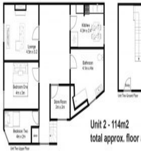
Unit 2 - 114m 2 total approx. floor area