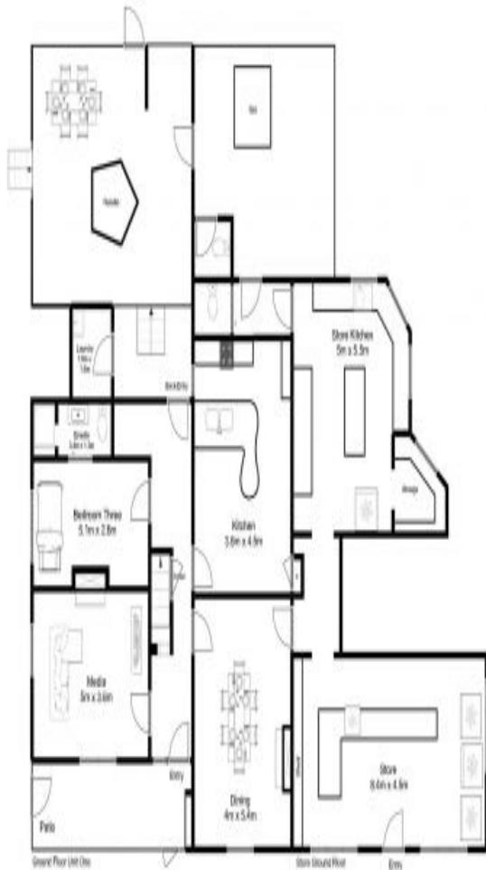
Ground Floor - Unit 1/Store 283m 2 total approx. floor area