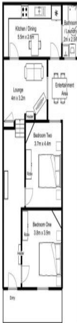
Unit 1: 1/273 Charles Street - 85m 2 total approx. floor area