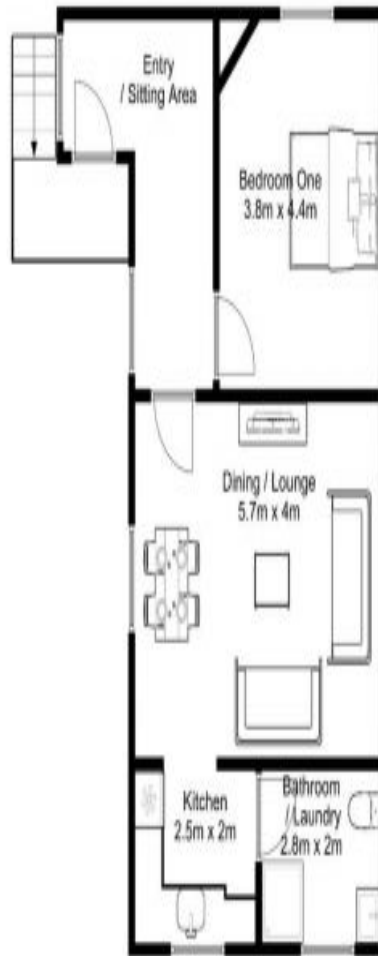
Unit 2: 1/271 Charles Street - 65m 2 total approx. floor area